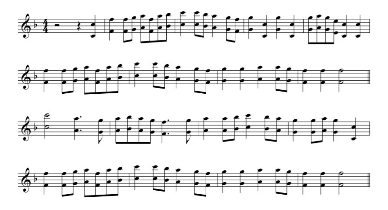
ETUDE 2 – THEME FROM MOZART SERENADE