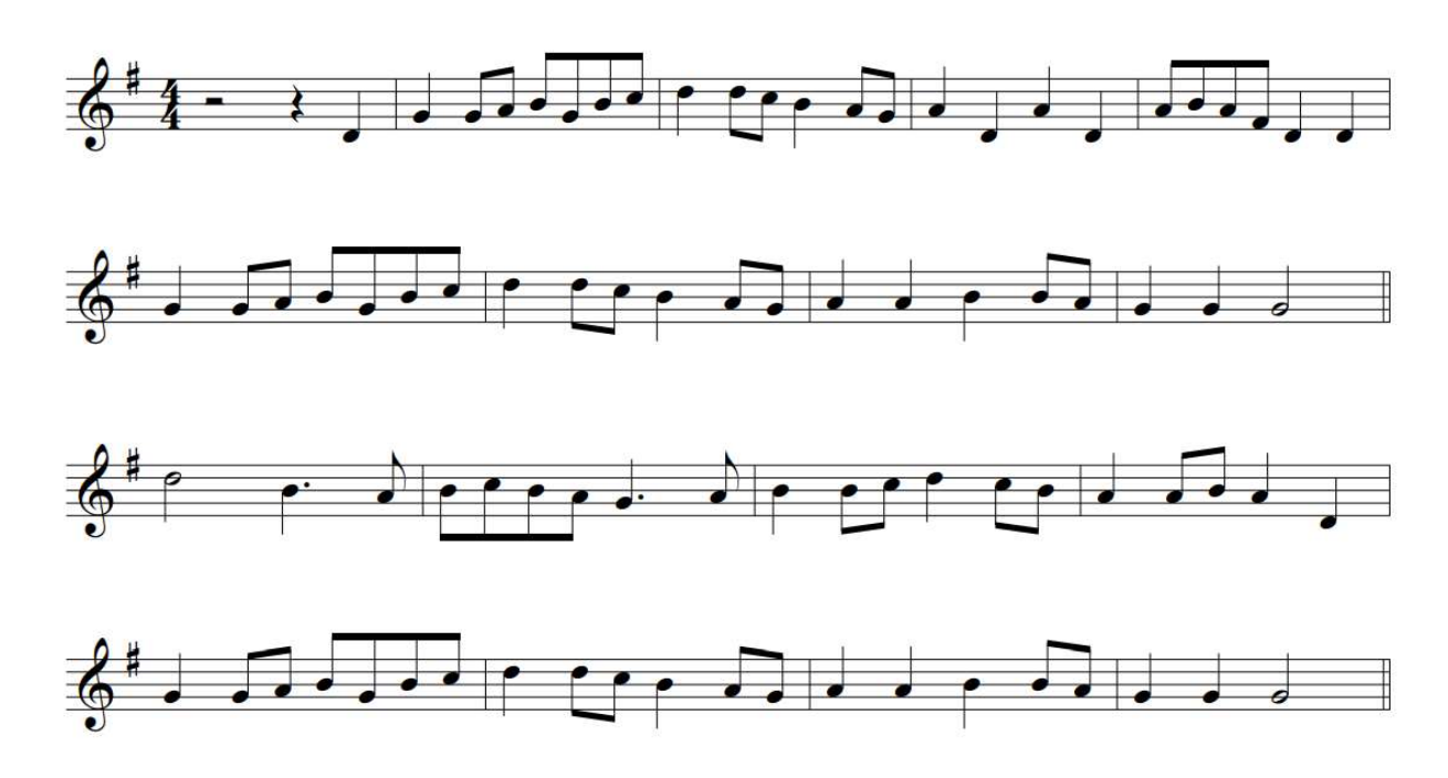
ETUDE 2 – THEME FROM MOZART SERENADE