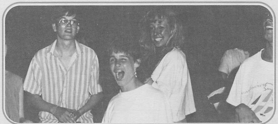
No way! -- It's time to party! At the conclusion of the Festival, participants had their own gala party at the Calgary Convention Centre. A little tired after some intense performances, they still managed to shake the house down with Wall Street, Vancouver's number one dance band.